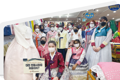
Traditional Market Culture Exchange for Foreign Residents