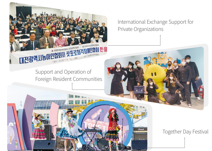
International Exchange Support for Private Organizations